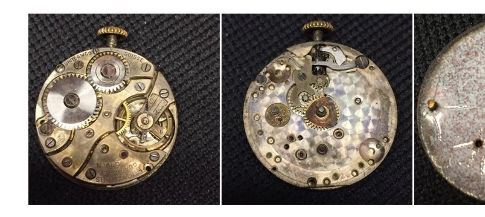
Page 2 of 2 ---- Generated from Vintage Gruen